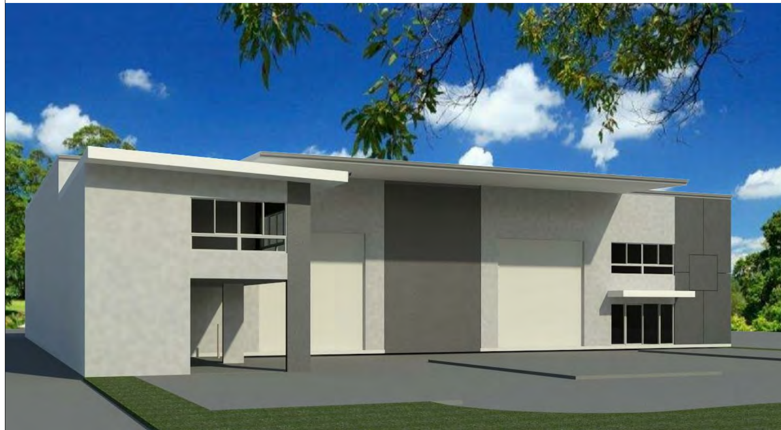
SOUTH EAST 3D VIEW