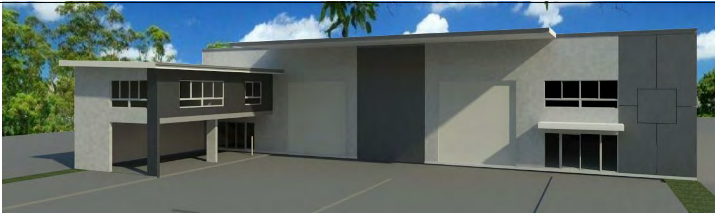
EASTERN 3D VIEW