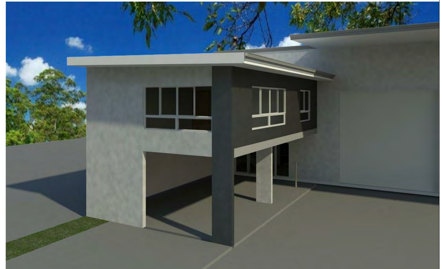
NORTH EAST 3D VIEW